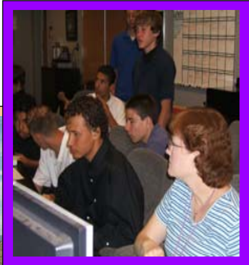
AAE 9th graders