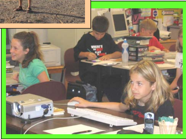
Rocklin Academy 6th graders