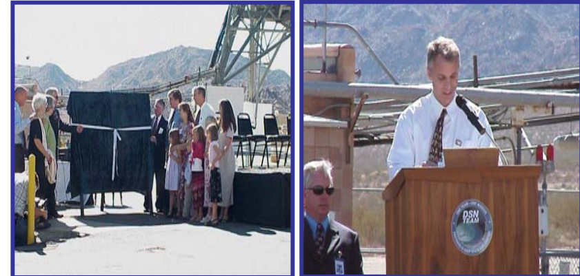
The Klein family gathers for the unveiling of the plaque that will be placed on the DSS-12 Radio Telescope.